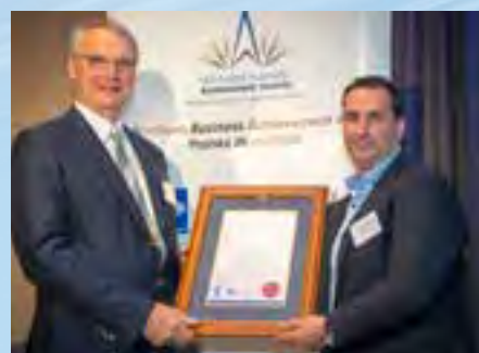
Chairman's Award - Kapiris Bros